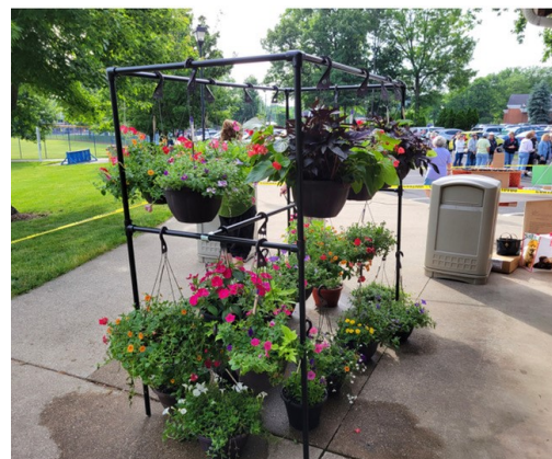
Goods for the Home & Garden *** Lots of lovely hanging baskets!