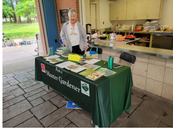
9:00 AM: Lined up & ready to buy! ??? Ask a Master Gardener!