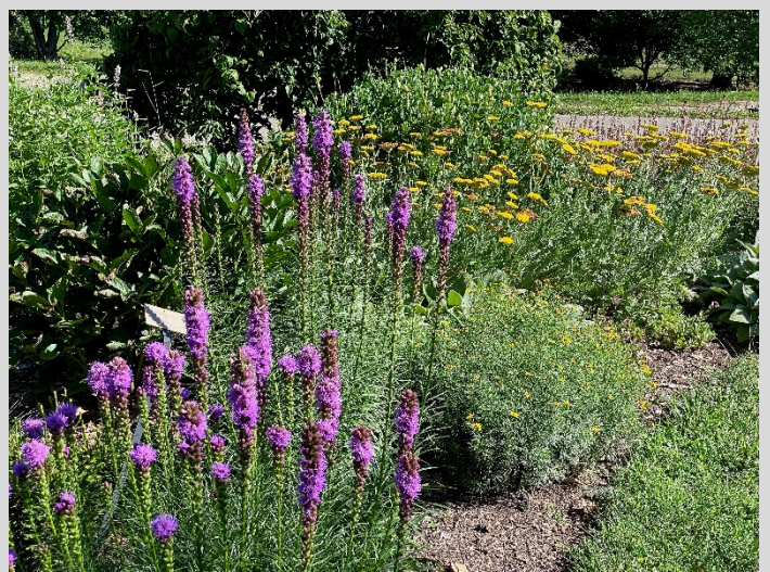
Pollinator Garden at Dawes Arboretum

COLLEGE OF FOOD, AGRICULTURAL, AND ENVIRONMENTAL SCIENCES