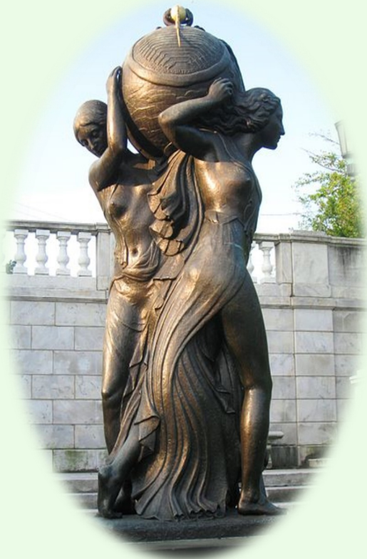
Night Passing Earth to Day by Frank L. Jirouch (3 March. 1878 - 2 May 1970), above the lagoon, south lawn of the Cleveland Museum of Art

The last stage was the installation of sculpture to enhance the public's experience. As it was a public garden, two drinking fountains were installed, and the garden was lit by lamps donated by the Cleveland Electric Illuminating Company. (p. 36) The Fine Arts Garden was dedicated on July 23, 1928, the 132th anniversary of Cleveland's founding. (p. 45)